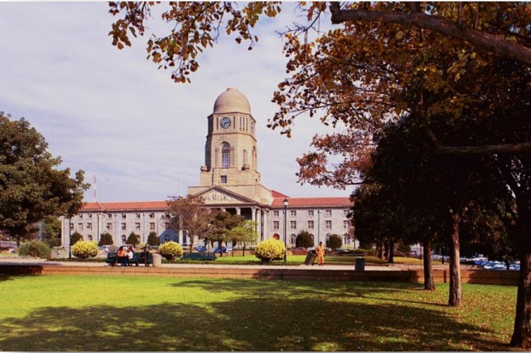
The Tshwane City Hall