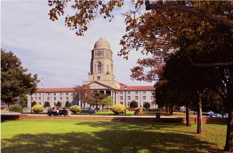
The Tshwane City Hall